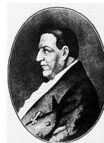
Friedrich Joseph Haass

He would walk down the rows of the unfortunate prisoners, stop before each individual and ask after his need — he never sermonized them; he spoke kindly to them — he gave them money, he brought them all sorts of necessaries for the journey, and gave them devotional books. He scarcely ever talked about the particular crimes of any of them, but listened if any volunteered information on that point. All the convicts were equal for him, and he made no distinction. He spoke to all as to brothers, and every one of them looked upon him as a father. He continued these acts of mercy up to his very death.